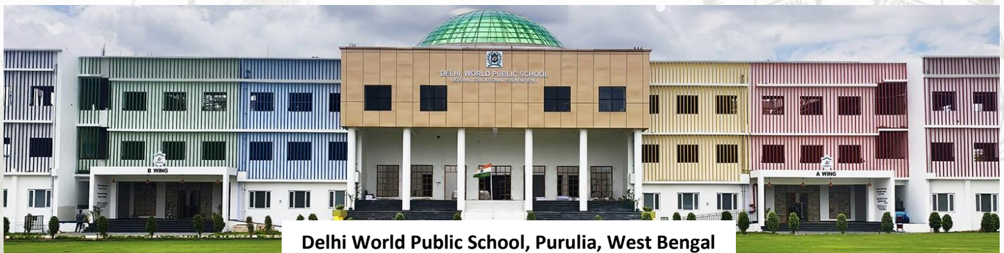
Delhi World Public School, Purulia, West Bengal

Organizing Committee CBSE Far East Zonal Taekwondo Championship 2026-27